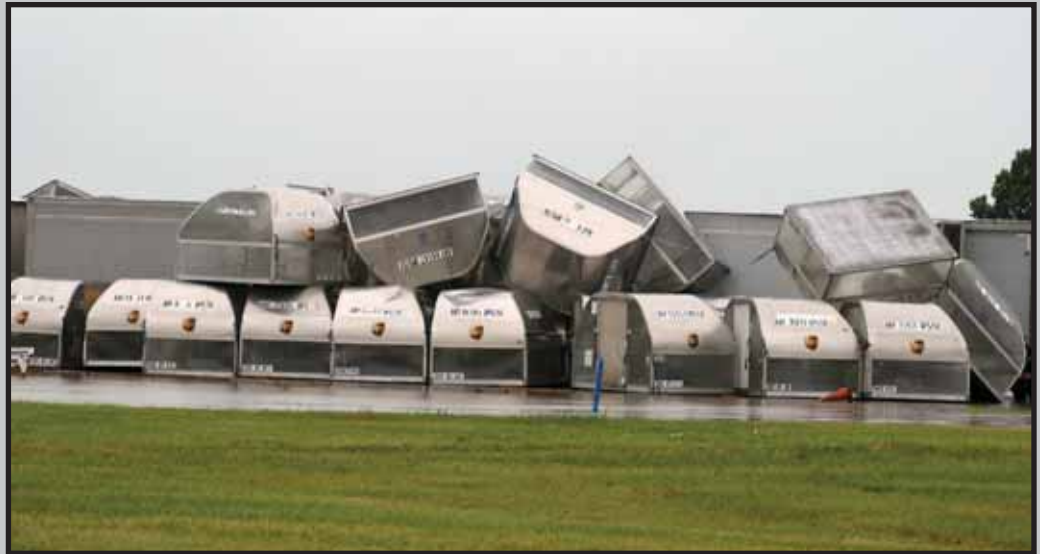
This picture shows some of the damaged package modules used to ship air cargo for UPS's airport operation. The adverse weather discarded the empty "cans" and threw them haphazardly around the cargo apron.

On June 22, 2007, a powerful storm system passed over Des Moines, bringing heavy rains, lightning, and 89 mile-per-hour wind gusts. It also spawned two tornadoes within minutes of each other just a few miles southwest of the Airport. With tornadoes on the ground Airport Operations Officers ordered the execution of tornado emergency procedures, wherein the concourses and terminal were cleared and all employees, travelers, and tenants were swiftly moved to the terminal's basement.