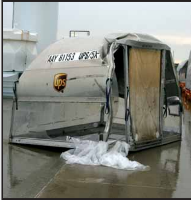
One of the United Parcel air cargo package “cans” that were damaged after being blown by the tornado-intense winds.

Although some passengers experienced inconveniences beyond the temporary base-ment diversion (a handful of inbound flights were diverted from Des Moines during the storm), for the most part, the Airport was back to normal operations within twenty-five minutes after the “all clear”. Arena claims the reasons for the successful evacuation and subsequent return to normal are threefold: “First of all, we had a procedure in place for an emergency like this; you just can’t operate without one. Second, the Airport’s staff and TSA security staff showed a strong willingness to go beyond the call of duty to both ensure our passengers’ safety and assist them in getting to their flights quickly. And third, the passengers themselves worked with us to take appropriate shelter during the tornado warning and showed a lot of patience despite the storm.”