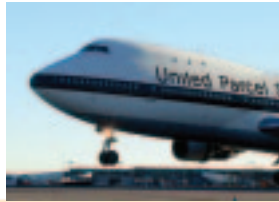
3 rd Place photo by Kris Klop shows a United Parcel Service 747 taking off.