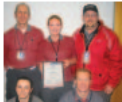
Five of the Comair staff here at the DSM International proudly display their recent regional award for customer service.